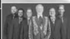
DOYLE LAWSON & QUICKCLIVER

Bluegrass on the Shores of MAINE "The Way Life Should Be"