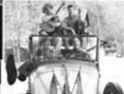
TENNESSEE MAFIA JUG BAND ON THE SUNDAY "Late Nite Stage"