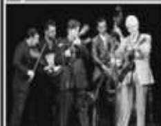
THE DEL McCOURY BAND