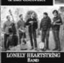
LONELY HEARTSTRING BAND