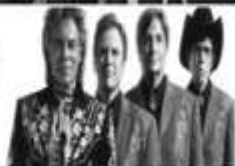
MARTY STUART & HIS FABULOUS SUPERLATIVES