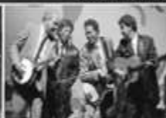
HOT RIZE with TED KIMBLE & THE TRAILBLAZERS